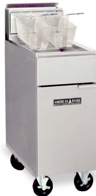
Capacity Reference AF-40 Model – 65 lbs of frozen French Fries per hour